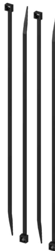
4 x Zip Tie