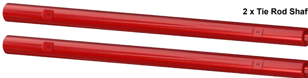
2 x Tie Rod Shaft