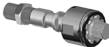
2 x Tie Rod End and Jam Nut