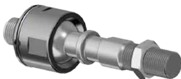
2 x Ball and Socket